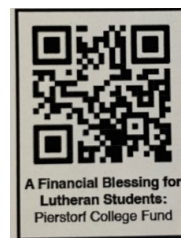
A Financial Blessing for Lutheran Students: Pierstorf College Fund

Students, attain the life you're called to live. The Pierstorf Memorial Fund offers zero-interest educational loans to Lutherans living in the state of Ohio. Students must be enrolled full-time in a four-year undergraduate program at any accredited college or university. Explore academic pursuits, discover your unique gifts, and grow in the Spirit with yearly loans up to $3,000. For more information and to apply, visit Pierstorf.org .